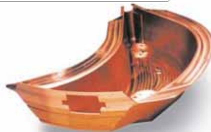
Medical device mold (Oxgeon free copper).