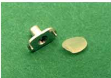
Micro parts and rice