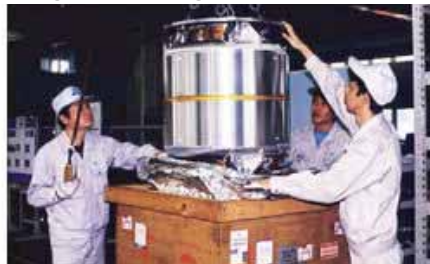
Shipping to NASA