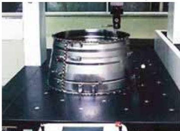
Development of engine parts (Ti alloys )